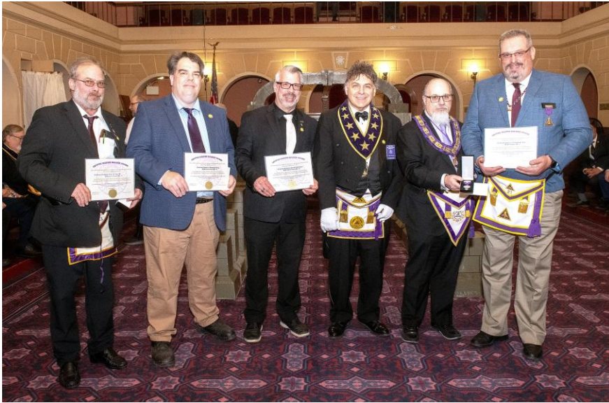
Cryptic Mater Builder Award presentations